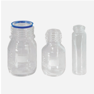
EG 094 | EG 062 | EG 066