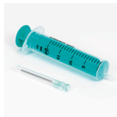
EGP 012 | EGZ 015