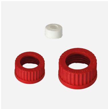
EZV 100 | EZV 104 | EZ 165