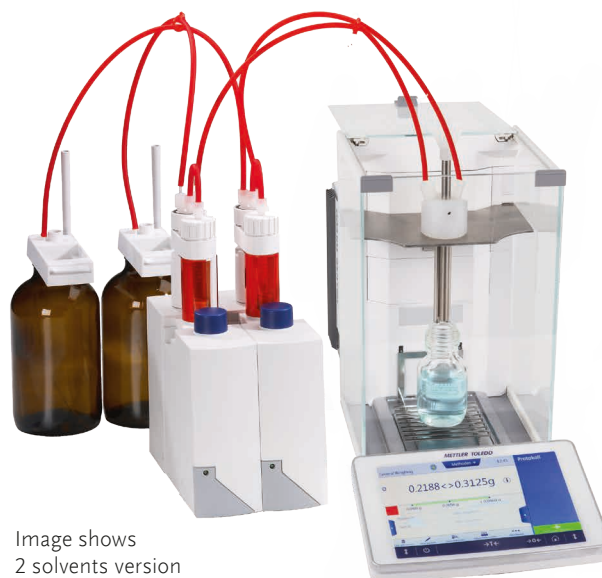
Image shows 2 solvents version