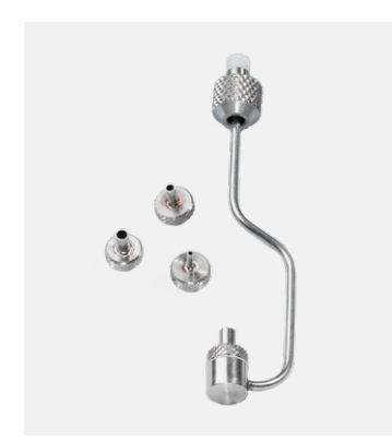
LMTZ908 Reverse measurement set

HX 441 Reverse needle UK4 Outer radius: 0.63 mm, inner radius: 0.42 mm