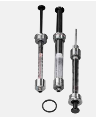
EGP 006 | EGP 008 | EGP 007