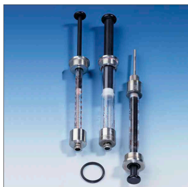
EGP 006 | EGP 008 | EGP 007