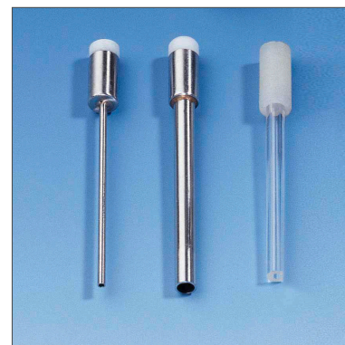
EGZ 007 | EGZ 06 | HX 453