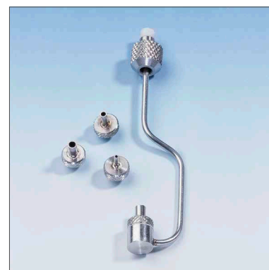
LMTZ908 Reverse measurement set