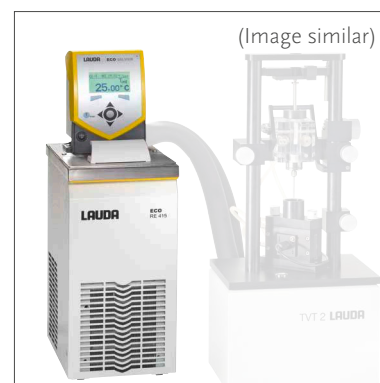
L001249 LAUDA RE 415 S